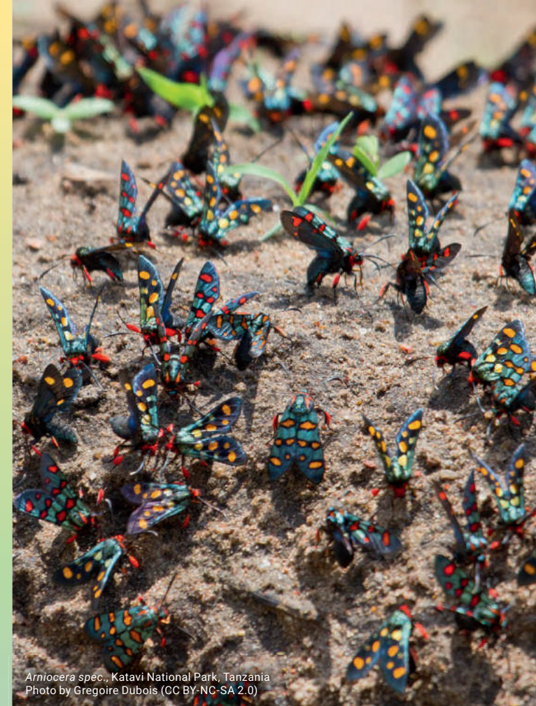
Arniocera spec. Katavi National Park, Tanzania