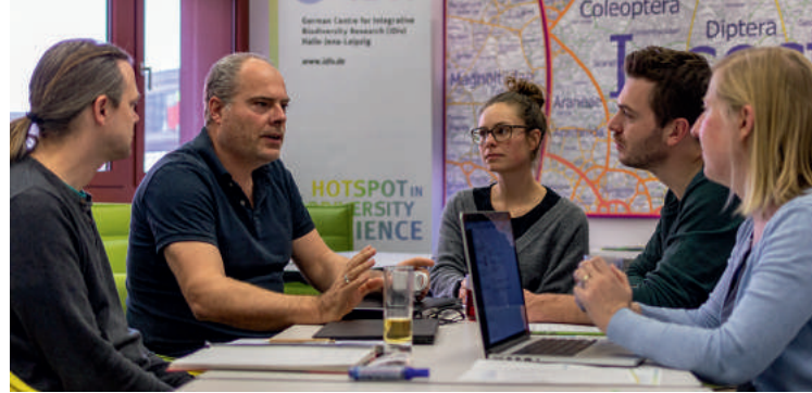
Participants of the sREplot working group

The sabbatical programme is designed to attract leading scientists in biodiversity research for a period lasting between a few months and one year (which can be divided into two or more visits of shorter duration).