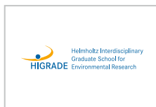
HIGRADE at the Helmholtz Centre for Environmental Research – UFZ

In addition, yDiv collaborates with the following graduate schools and research training groups locally: