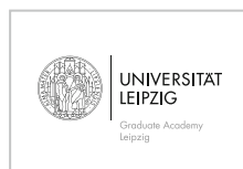
Graduate Academy Leipzig (GAL) at Leipzig University

In addition, yDiv collaborates with the following graduate schools and research training groups locally: